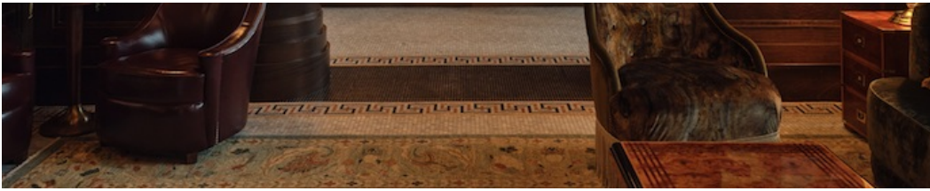
The Ned NoMad includes a public bar and restaurant, as well as the members-only Ned's Club, which features both mezzanine and rooftop bars as well as a terrace restaurant.