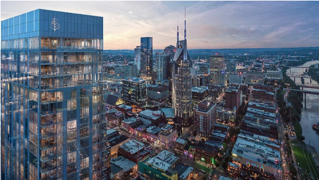
The 40-storey Four Seasons Hotel Nashville , opening this year in Music City, connects guests to the creative spirit of the city's makers and artisans. Situated just one block from the entertainment hub of Broadway in Nashville's SoBro district, the new Four Seasons hotel will feature 235 guest rooms and suites as well as private residences, a new chef-driven dining concept, a full-service spa and resort-style pool deck, event spaces, and more. Its glass tower allows for sunlight to stream in from all sides, with panoramic city and river views in every direction. Light-filled interiors pay homage to Tennessee's iron industry heritage, while making use of steel, copper, bronze and the state's native black walnut, with an art collection featuring local and international contemporary works. Four Seasons Hotel Nashville will also introduce a new dining concept, a resort-style experience for guests with a rooftop pool deck; unveil a new spa; and host weddings, galas and more in its event spaces.